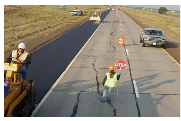
Region 4 Fort Morgan overlay project.

Mineral rights are interpreted to mean the "deep" mineral interests such as oil, natural gas or coal, not the surface mineral interests such as sand and gravel.