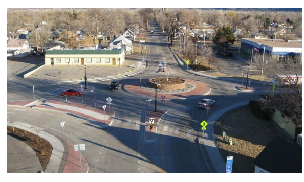
Region 2 Roundabout project in Canon City

https://www.codot.gov/business/designsupport/bulletins_m anuals/row-manual.url/