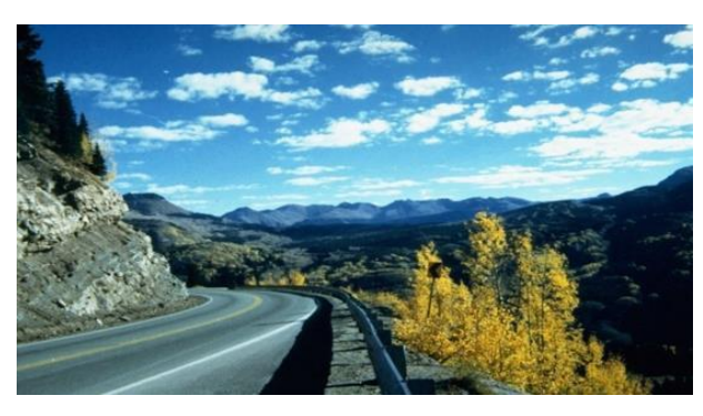
Region 5 Colorado's Famous "Million Dollar Highway" Part of the San Juan Scenic Skyway US 550

If improvements are considered personal property under state law, the tenant-owner may be reimbursed for moving them under the relocation assistance provisions. The real estate specialist will personally contact the tenant-owners of improvements to explain the procedures to be followed. Any payments must be in accordance with federal rules and any applicable state laws.