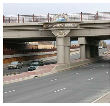
Region 1 Wadsworth and Grandview bridge

In Colorado, you can choose to have a board of commissioners or a jury determine the amount of compensation you are due for the property acquired by the Agency. These proceedings take place in a "valuation hearing" (commission) or "valuation trial" (jury), and you and the Agency will be allowed to present information to the court about the fair market value of the property acquired. The commission or jury will determine just compensation for the acquisition, and the final amount of just compensation will be certified by the court upon conclusion of the value hearing or trial.