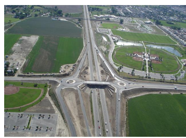
Region 3 I-70 at 24 Road Grand Junction. New bridge and two roundabouts

The valuation process used and the product produced when the Acquiring Agency determines that an appraisal is not required, pursuant to 49 CFR Part 24 § 24.102(c)(2) appraisal waiver provisions.