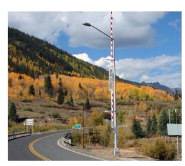
Region 5 US 550 Silverton

Sometimes tenants lease real property and build or add improvements to the leased property for their use. Tenants often have the right or obligation to remove the improvements at the expiration of the lease term. If, according to the appraisal, the improvements are considered to be real property, the Agency must make an offer to the tenants to acquire these improvements.